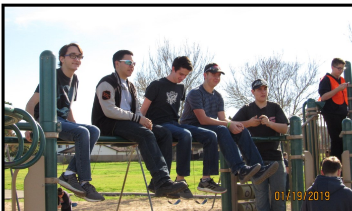
Above: Our team watching a rocket launch

We are already half way through build season, and the competitions are swiftly approaching. Everyone has been working hard to prepare for this year's FIRST Robotics Competition. We've made significant progress these past three weeks, especially in the assembly of our proto-bot (prototype robot). The drive train is fully assembled, the electrical board is mounted, and thanks to the software team our drive train is fully functional. Software has put together an operational vision system on the proto-bot. Using a camera on the front of the robot, our drivers will be able to see the environment the robot is in. We will use the camera to navigate through the sandstorm period (a period during the first 15 seconds of the math where the robot isn't visible to the drivers) during competitions. Because we are far ahead mechanically, we have been able to discuss alternative design ideas for our robot that differ from the ones we previously discussed. Along with all the progress on the proto-bot, we have completed a prototype elevator and we are in the process of building our competition elevator, which we aim to have fully operational next week. We've used our momentum from last week to get ahead and we hope to have our competition robot operational by the end of next week.